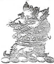
Vernon Semper Viret