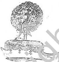
Pour y parvenir

A Boar's head, erased, Sa, Ducally gorged and bristled, Or.